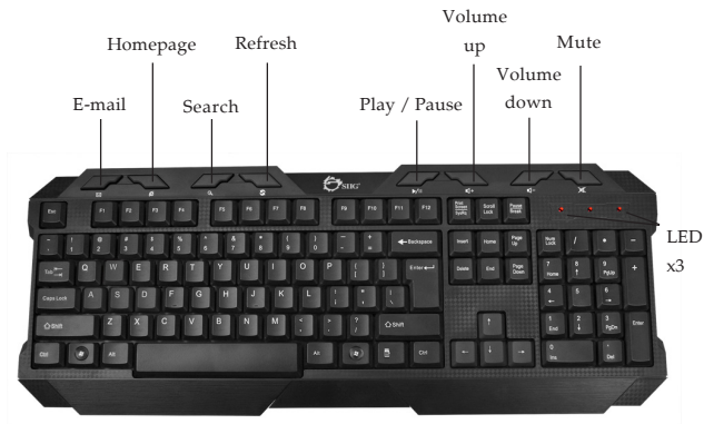
Figure 1: Front Layout