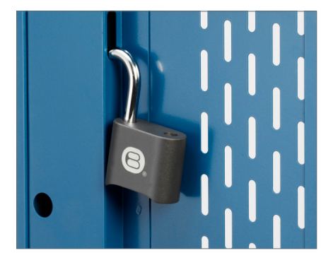
Interior Door Lock Holder