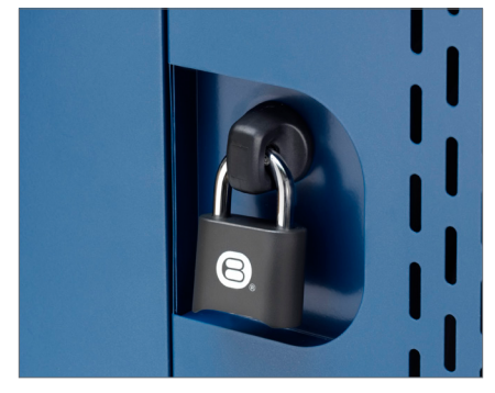
Inserting The Shackle / Lock Programming