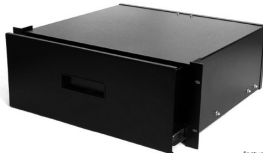
*actual product may vary from photos