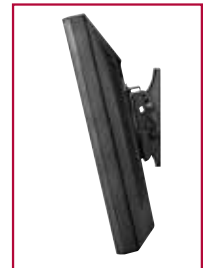
Low-profile design holds display only 1.58" (40mm) from the wall