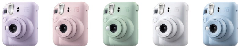
LILAC PURPLE BLOSSOM PINK MINT GREEN CLAY WHITE PASTEL BLUE