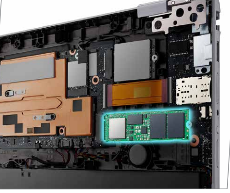
An M.2 SSD slot for optional storage of up to 1 TB for large or growing collections of videos, music or school documents.