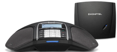
KONFTEL 300Wx ANALOG

Simple and reliable. Konftel 300Wx with Konftel DECT Base for analog connection. Simply plug the base station into the phone jack and your wireless conference solution is ready to go, with up to seven phones connected.