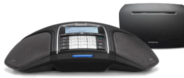
KONFTEL 300Wx IP

Teaming the Konftel 300Wx with the Konftel IP DECT 10 is one of our most popular solutions. Now it is available as a single package, delivering wireless conference calls in HD quality via your IP telephony system (SIP). Each IP DECT base can handle up to 20 registered Konftel 300Wx devices and five ongoing calls.