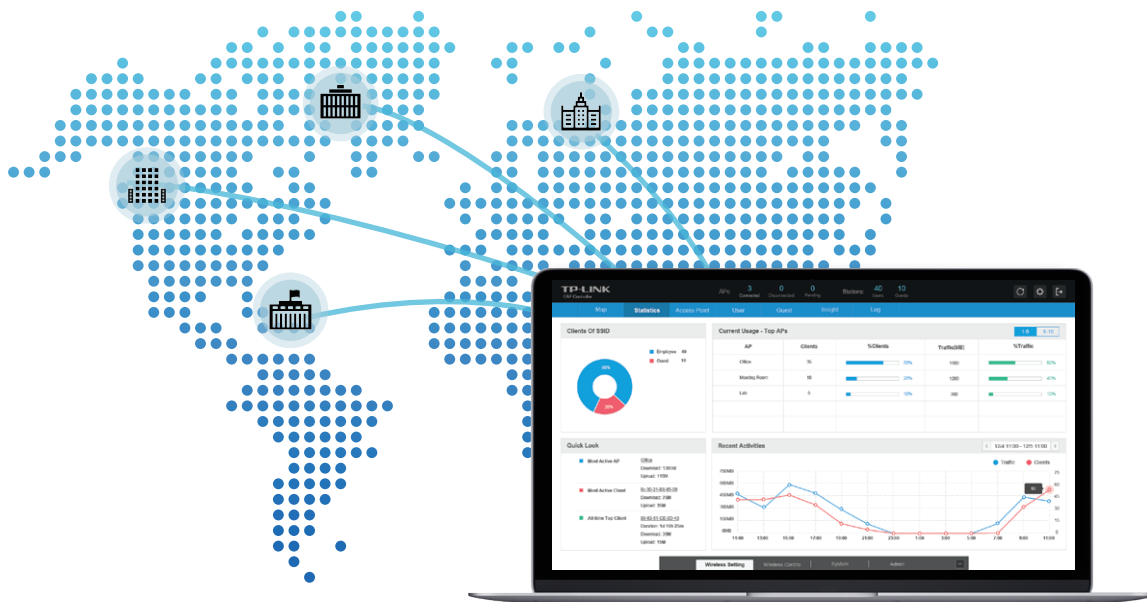
EAP Controller Software