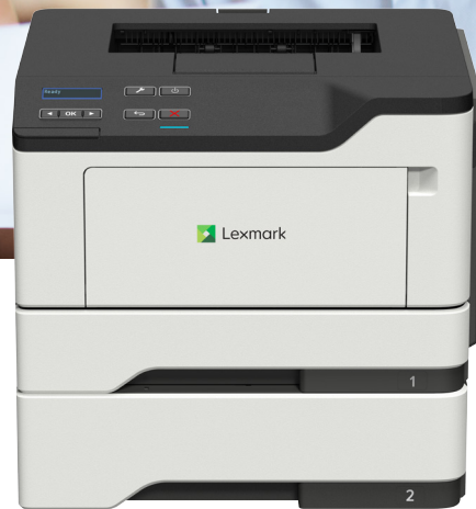
B2338dw with optional tray