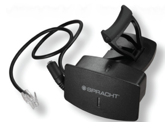
Remote Handset Lifter available separately RHL-2010