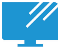
Diagonal edge-to-edge Glass Display