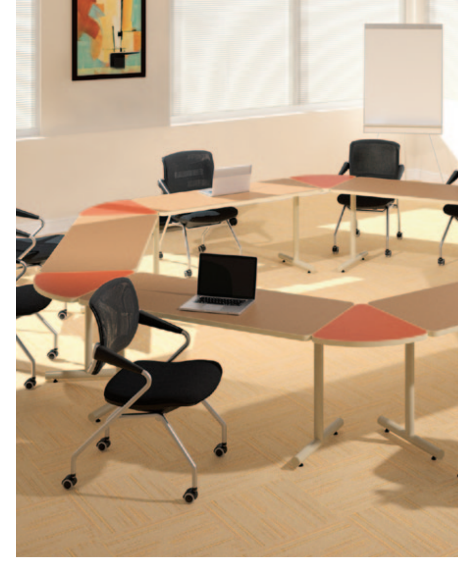
T-Mate Tables in Rhinestone Cowboy/Taupe and Pie Connectors in Valley of the Sun/Taupe. Shown with Valoré TSM2 Chairs (page 15).