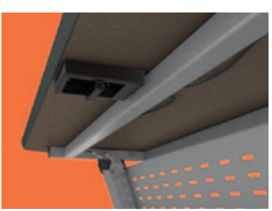
One control, one person, one hand – that's all it takes to flip the table top.