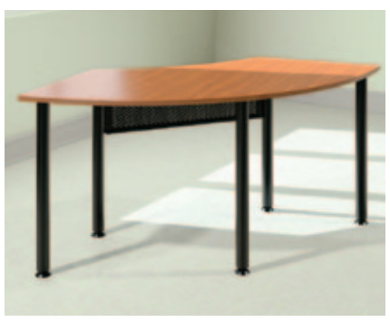
Crescent tables extend your room planning flexibility.