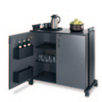
1015HC Hospitality Cart