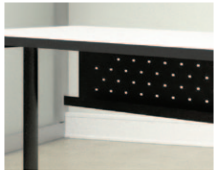
Optional steel modesty panels feature a generous trough for table-to-table cabling.