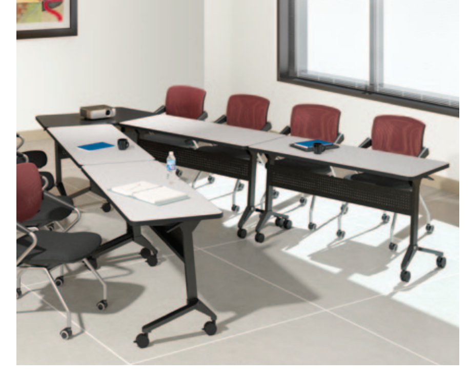
Flip-N-Go Tables in Folkstone/Black with Black/Black Transition Table and Valoré TSM2 Chairs (page 15).