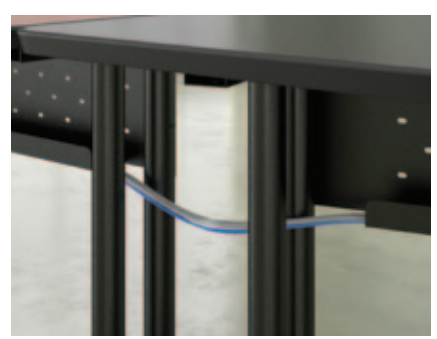
Modesty panel offers an extra-deep cable trough and supports table-to-table pass-thru for cord management.