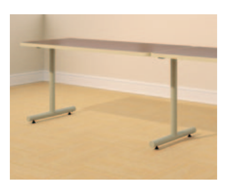
One-legged Adder tables can be joined to two-legged Starter tables in either direction.