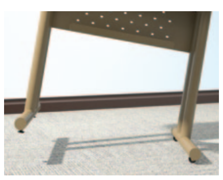
Integrated wheels in one foot allow for wheelbarrow-style mobility.