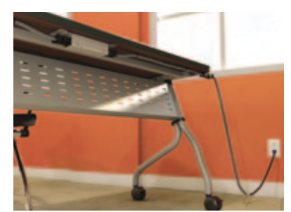
An integrated modesty panel with built-in cable trough manages flexible power options (see page 14).