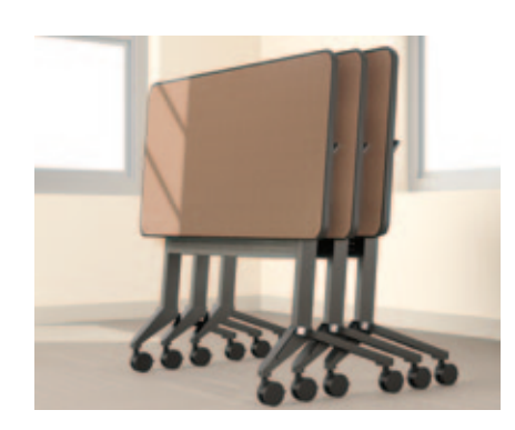
Leg design allows tables to nest neatly together in a straight row.