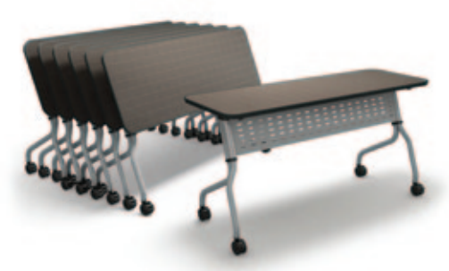
Tables straight-line nest for compact storage.