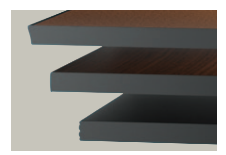
Choice of Knife-edge T-Mold, Standard T-Mold and Fluted T-Mold.