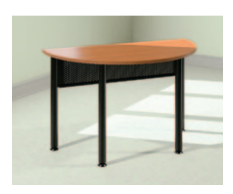
Half-round tables bridge rectangular tables to maximize space.