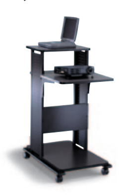
1010PC Presentation Stand