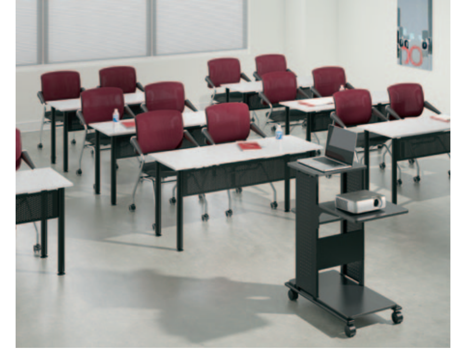
Encounter Tables in Folkstone/Black. Shown with Presentation Stand (see page 14) and Valoré TSM2 Chairs (page 15).