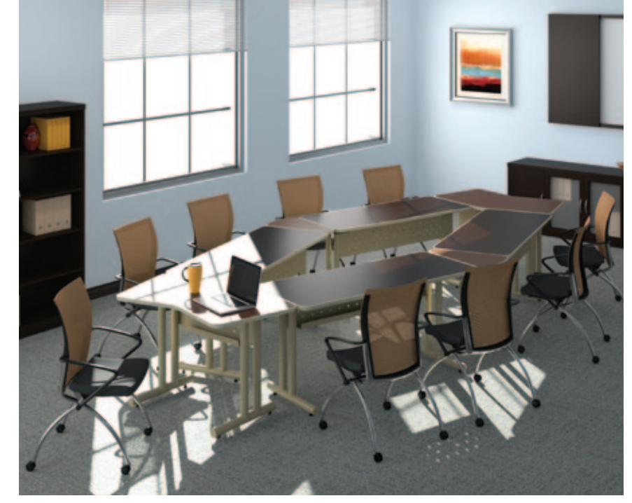
Meeting Plus Tables in Mocha/Taupe with Burnished Chestnut/Taupe Pie Connectors and Transition Tables. Shown with Aberdeen Bookcase, Visual Presentation Board and Low Wall Cabinet, and Valoré TSH1 Chairs (see page 15).