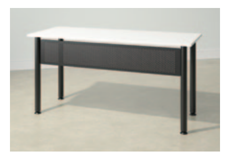
Tables come standard with modesty panels.