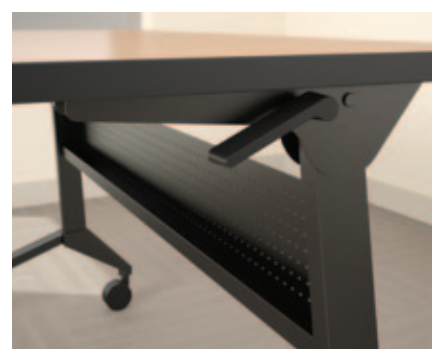
Dual-sided levers allow easy flip action. Integrated cable trough in modesty panel manages flexible power options (see page 14).