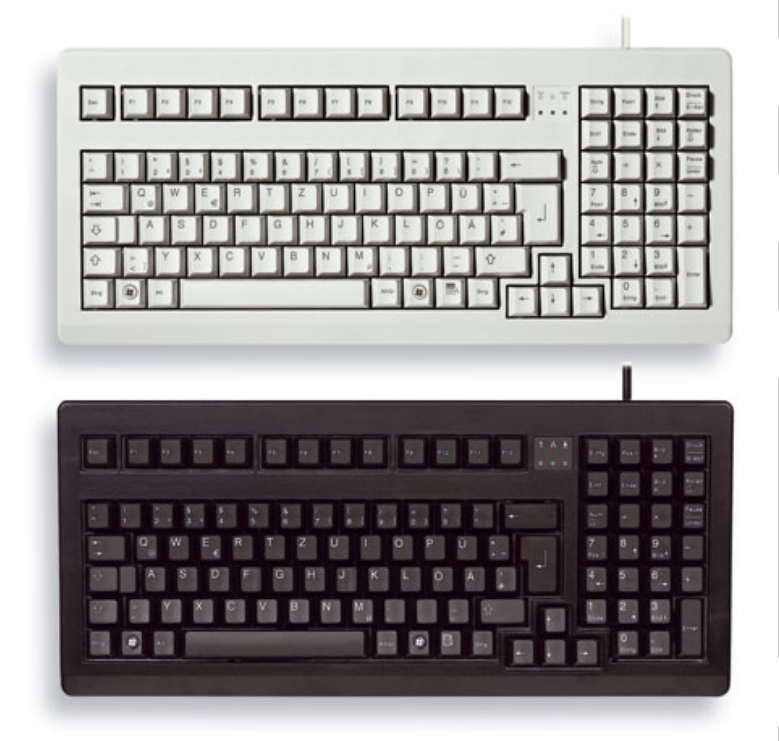
Models may vary from the image shown