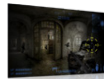
Game Mode ON

ViewSonic's Game Mode provides heightened visibility and detail by brightening dark scenes. Dominate the competition and see your opponents' every move, even in the darkest scenes of a video game. With just the press of a button, ViewSonic's Game Mode delivers superior color performance for the ultimate gaming experience.