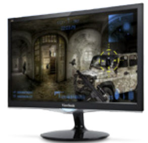
Game Mode ON