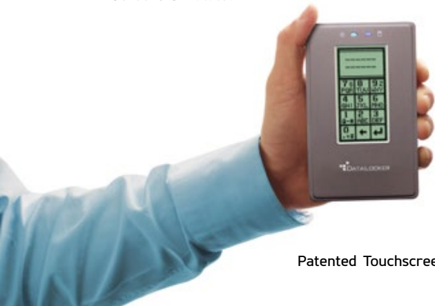
Patented Touchscreen Display