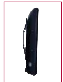
Low-profile design keeps display 1.18" (30mm) from the wall